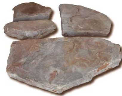
East Sierra Thin Flagstone