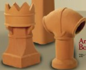
Anchor Bonnet ●