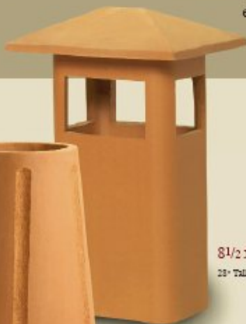
8 1/2 x 13 Peerless ● 28" Tall