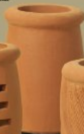
Mini Windsor ○